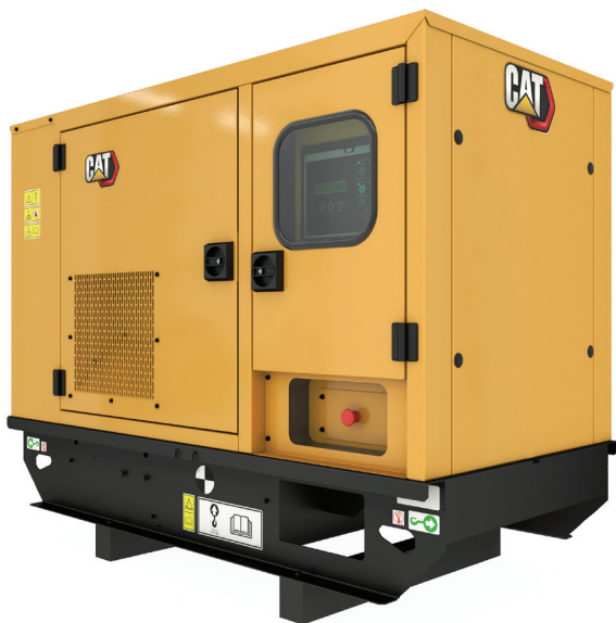
Picture shown may not represent actual configuration

The sound attenuated enclosures reduce sound levels to comply with the stage II levels of the European Community Directive 2000/14/EC, effective from 3 January 2006.