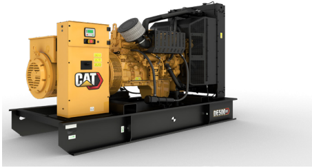
Image shown might not reflect actual configuration